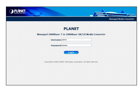
Figure 1. Web Login Screen of Managed Media Converter

To access the Web interface then the Web login screen appears in Figure 1.