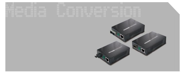
Quick Installation Guide

Managed 10/100/1000Base-T to 1000Base-SX/LX Media Converter GT-90X Series