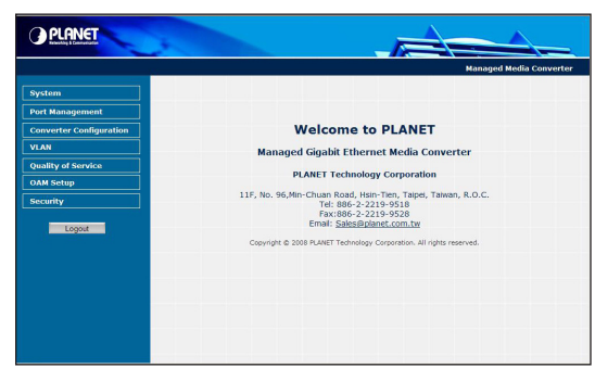
Figure 2. Web Main Screen of Managed Media Converter

After entering the password (default user name and password is "admin") in login screen (Figure 1 appears). The Web main screen appears as Figure 2.