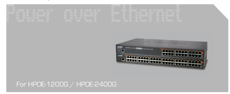
Quick Installation Guide