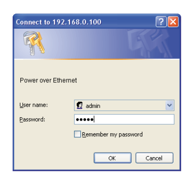
Figure 1. Web Login Screen of PoE Injector Hub

After entering the user name and password in login screen. The Web main screen appears as Figure 2.