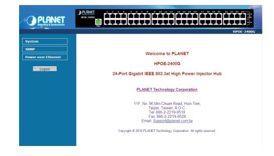
Figure 2. Web Main Screen of HPOE-2400G

After entering the user name and password in login screen. The Web main screen appears as Figure 2.