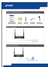
Quick Installation Guide

The package should contain the items plus FRT-420N. If any item is missing or damaged, please contact the seller immediately.