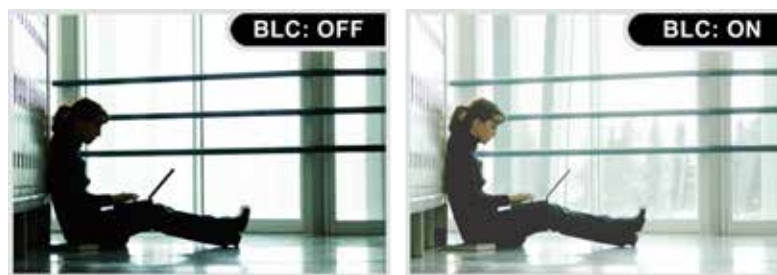
Back Light Compensation

Together with powerful image processing attributes like Back Light Compensation (BLC) and 3D Digital Noise Reduction (3DNR) technology, the ICA-4230S is able to adjust the exposure of the entire image to properly expose the subject in the foreground and remove noises from video signal. Thus, it brings an extremely clear and exquisite picture quality even under any challenging lighting conditions.