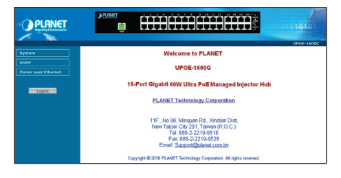
Figure 3-3: Web Main Screen of Ultra PoE Managed Injector Hub

The following web screen is based on the UPOE-1600G. The display of the UPOE-800G is the same as that of the UPOE-1600G.