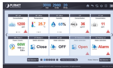
Complete Data Report