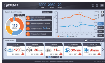
User-friendly Dashboard Design