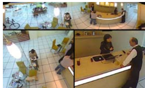
360° broad view with 2 PTZ