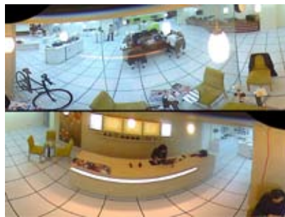
180° double broad view