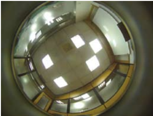
360° Table view