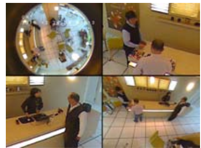
360° source view with 3 PTZ