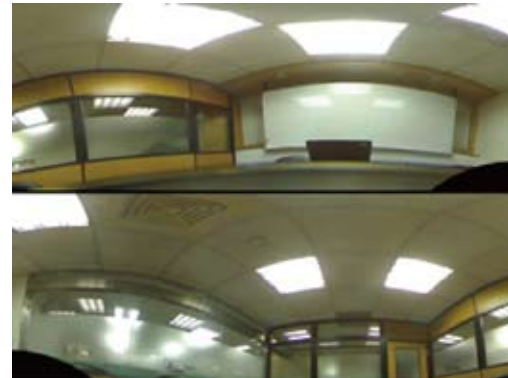
180° double table broad view