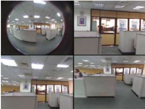
180° source view with 3 PTZ