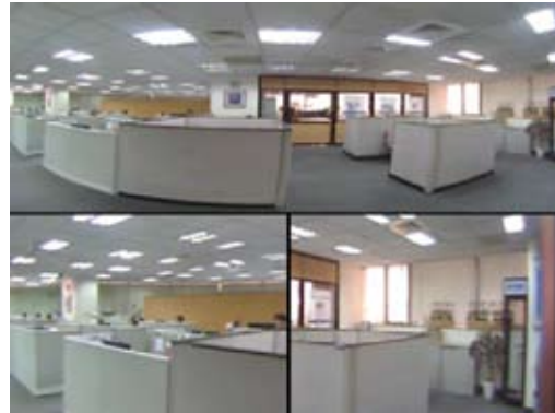
180° broad view with 2 PTZ