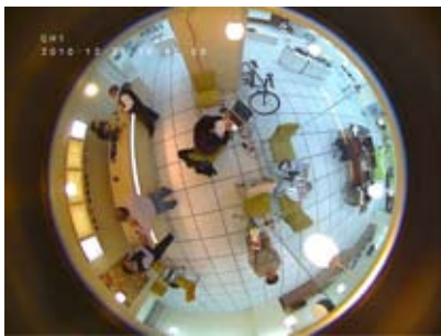
360° Source image