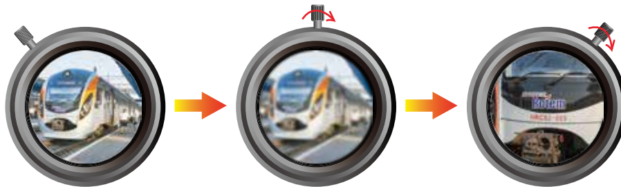
Vari-focal lens for available focal lengths

The ICA-5550V incorporates the mega-pixel vari-focal lens, which has the option of selecting a high millimeter setting for narrow viewing fields or a low millimeter setting for wider viewing fields. The ICA-5550V provides three individually configurable motion detection zones. The camera can record video or trigger alarms or alerts when camera image is tampered.