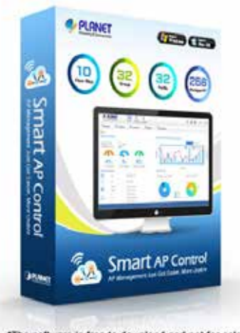
*The software is free to download and not for sale