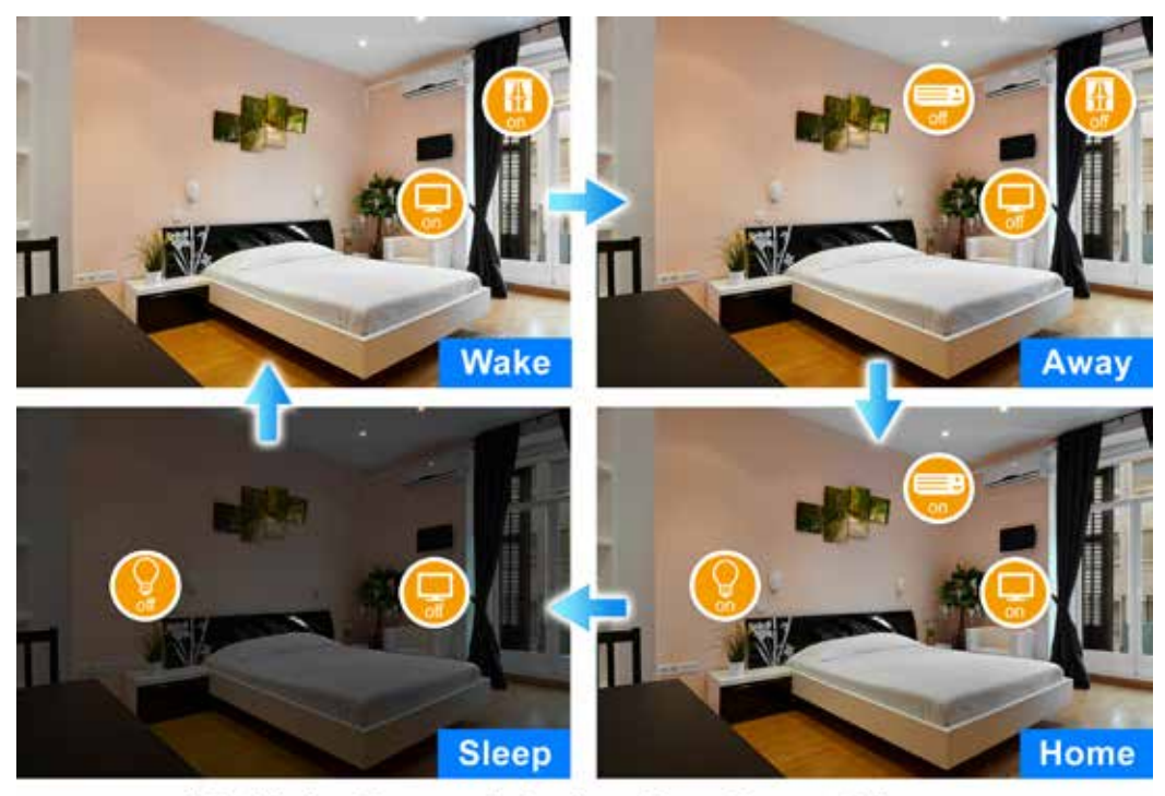
Multiple Scene Modes For Smart Home

You can easily install the HAC-1000 Z-Wave Home Automation Control Gateway for home automation system control on your Indoor Touch Screen. In the "Scene" mode, you can set everything you want in every room of your home for any activity or anything in-between from morning to night. Four kinds of scenes can be created and customized to your personal preferences.