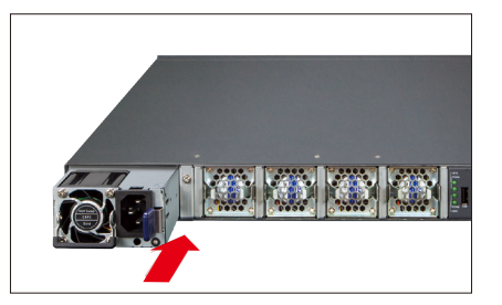
Figure 3-2 Sliding the Power Supply Unit into the Compartment

2. Install the redundant power supply unit by sliding it into the compartment.