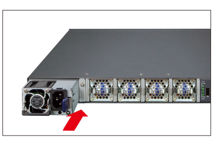
Figure 3-3 Tightening the Thumbscrews

3. Next, tighten the thumbscrews clockwise on both sides.